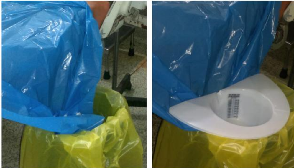
Fig. 1. Delivery setup used for blood loss estimation

clinical bias, large enough to cause significant differences in diagnosis. As the average of both methods and of the measured blood loss increased, the scatter and difference between the two methods decreased. This indicates an underestimation by visual estimation (Fig. 2).