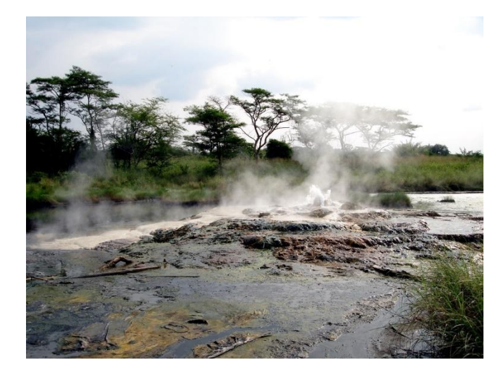
Fig. 2. Illustration of a geothermal hot spring at Sempaya

temperature, fluid chemistry and other petro physical parameters are being done. Geothermal power is costed at U.S$ 0.077 per kWh which is cheaper than most renewable energy resources like hydro and solar [15]. Installing 150 MW of geothermal power would allocate electricity to 3,000,000 people in rural areas of western Uganda.