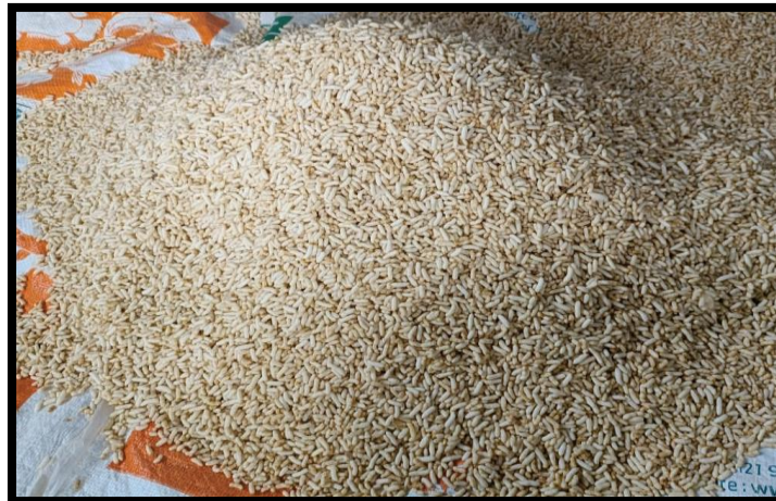
Plate 3. Puffed rice

The proximate composition and colour values of the raw rice and puffed rice are given in the Table 5. From it is inferred that, the moisture content, crude protein, crude fat, crude fibre contents have decreased after puffing and total ash and carbohydrate content increased after puffing. The colour values of raw rice and puffed rice had a significant difference due to high temperature treatment and conditioning given to rice led to change in L^* , a^* and b^* values from 59.26 \pm 0.45 , 3.45 \pm 0.16 and 20.53 \pm 0.36 to 73.33 \pm 0.64 , 2.36 \pm 0.06 and 17.92 \pm 0.58 , respectively.