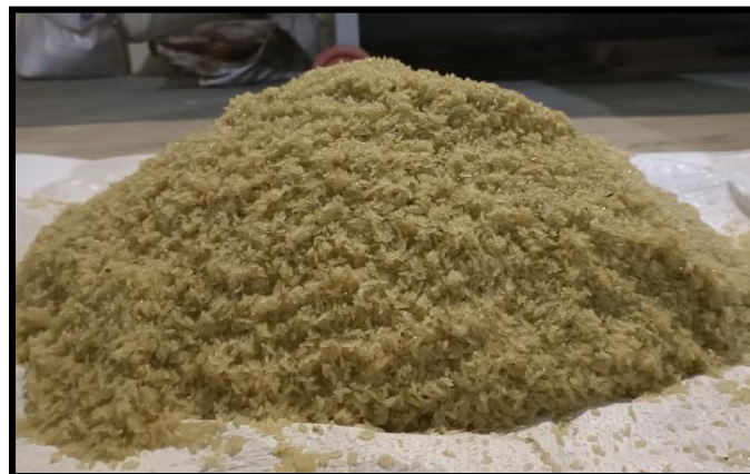
Plate 2. Conditioned rice (IR-64)