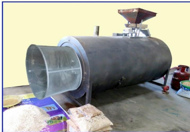
Plate 1. Rice puffing machine developed by IGKV Raipur

Conditioning of milled rice before puffing is crucial for production quality puffed rice. It involves a hydrothermal treatment to eliminate air voids within the rice kernel and maintain optimum moisture content. The process flowchart for rice conditioning is presented in Fig. 1.