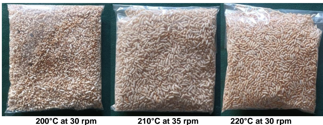
Plate 4. Puffed rice packets