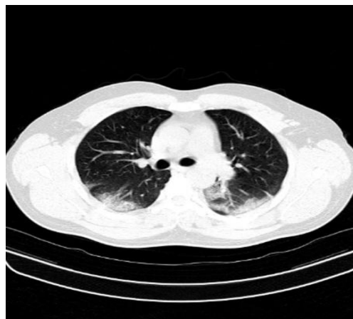
Fig. 2. CT Thorax showing mild bilateral lower lobe Ground glass opacity