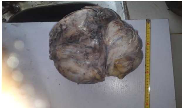
Fig. 3. Photograph of the macroscopic finding of the tumour