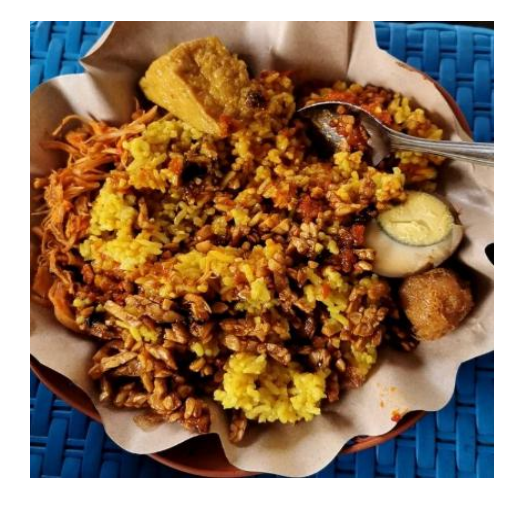
Fig. 1. Turmeric and Indonesian traditional yellow rice