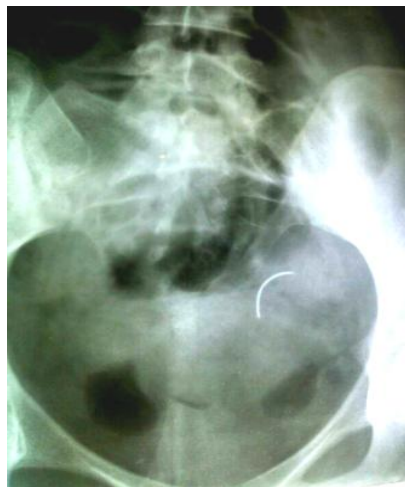
Fig. 1. Radiograph showing the broken needle fragment

Under General Anesthesia, the abdominal cavity was explored. There was no bleeding and the broken needle fragment was located embedded in the anterior rectus sheath with no injuries. On successful removal of the fragment, it was confirmed using the C-arm that there is no other fragment left behind.