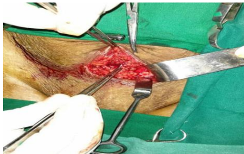
Fig. 3. Retrieval of broken needle fragment