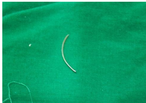
Fig. 4. Broken needle fragment

Post-operative course was uneventful. Patient discharged on 8 th post-operative day. Although, patient was fit for discharge on 3 rd post-operative day, the relatives of the patient requested to get discharged only after suture removal. She was followed up after one week with no complaints and healthy wound.