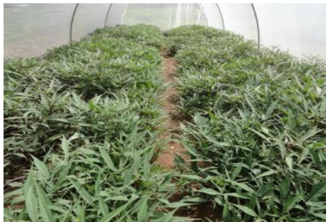
Fig. 1. Tunnel of multiplication of cuttings of sweet potato