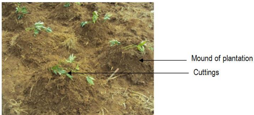
Fig. 2. Hump cuttings planting (Dibi et al. 2015)

The harvesting was done by hand at the ripening of the tubers using tools with great care in order to avoid the various alterations of the tuberous roots to have satisfactory yields which are kept well and long. Harvest occurred about 4 to 6 months after planting. Ripening was also appreciated by observing yellowing of the leaves, followed by thinning or by the clear colour of the latex that comes out when cutting the tubers.