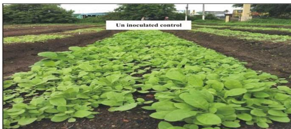
Fig. 1. Pre colonized tobacco seedlings with native UASDAMF cultures in the nursery bed at 45 DAS