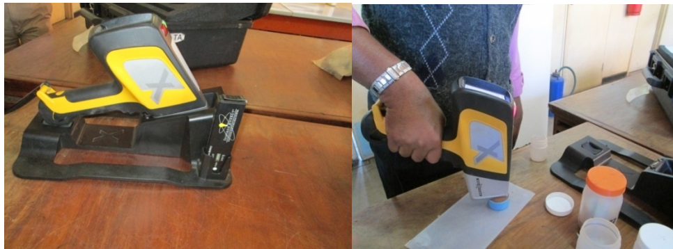
Plate 1a & b. Hand held XRF machine for soil analysis, department of geological survey, Zomba Malawi

Hand held XRF machine (Plate 1 a & b), core soil samplers, soil auger, a photo and thermo insensitive medium duration pigeon pea variety (ICEAP 00557) a long-duration pigeon pea variety (ICEAP), groundnut (CG 7), early maturing maize variety (SC 403) and Triple Super Phosphate (TSP).