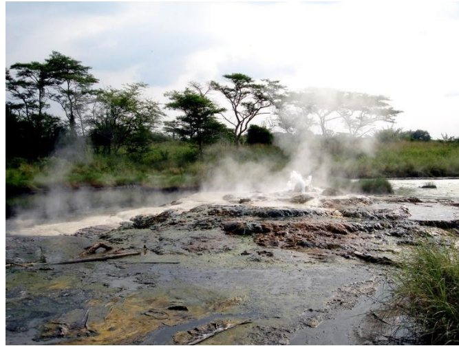
Fig. 2. Illustration of a geothermal hot spring at Sempaya

temperature, fluid chemistry and other petro physical parameters are being done. Geothermal power is costed at U.S$ 0.077 per kWh which is cheaper than most renewable energy resources like hydro and solar [15]. Installing 150 MW of geothermal power would allocate electricity to 3,000,000 people in rural areas of western Uganda.