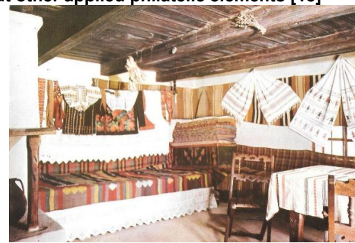
(d) interior view, distant plane, without other applied philatelic elements [20]