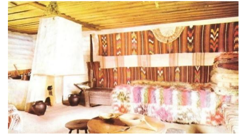
(b) interior view, distant plane, without other applied philatelic elements [31]