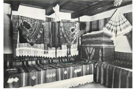
(c) interior view, distant plane, without other applied philatelic elements [19]

(a),(b) inside view, double-sided, without other applied philatelic elements [18]