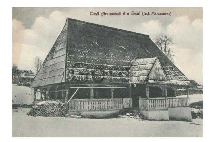
Fig. 1. Illustrated postcard representing the exterior of the household from leud (Maramureş)