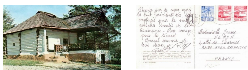
(a),(b) exterior view, double-sided, without other applied philatelic elements [27]