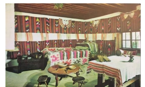
(a) interior view, distant plane, without other applied philatelic elements [30]