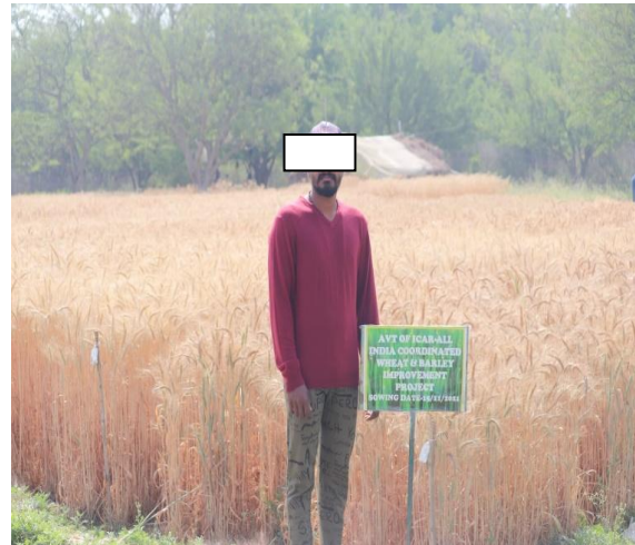
Fig. b. Wheat crop at harvest stage