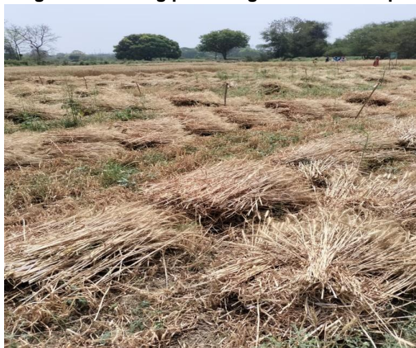
Fig. c. Harvested wheat crop