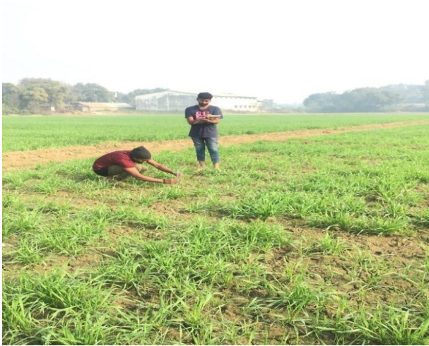
Fig. a. Measuring plant height of wheat crop