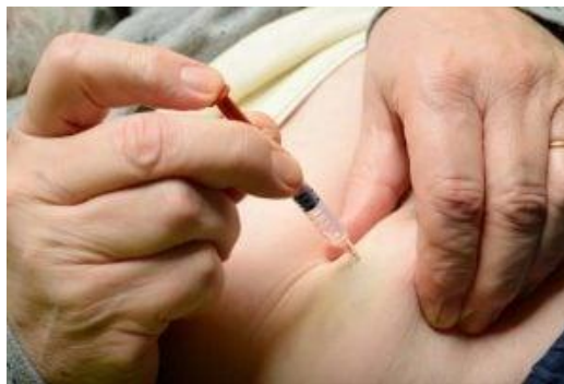
Fig.1. Administration of LMWH