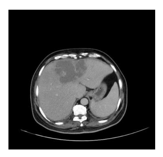
Fig. 1. Well defined hypo enhancing lesion with irregular margins of size 9.2X6.3X7cm in segment IVA and B