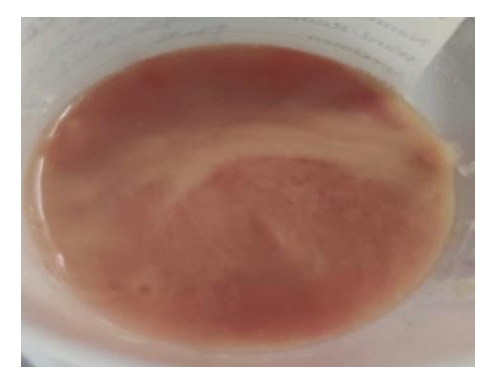
Fig. 3. Anchovy sauce pus