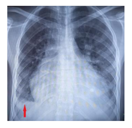
Fig. 1. Chest X ray showing a cardiomegaly with a minimal right pleural effusion *the red sign indicates the right pleural effusion

No pulmonary nor systemic embolism, nor deep infectious source were detected in the Body CT scan. Serologic tests to hepatitis B, hepatitis C, human immunodeficiency virus (HIV) and syphilis were negative. oral and otolaryhgological examination were normal.