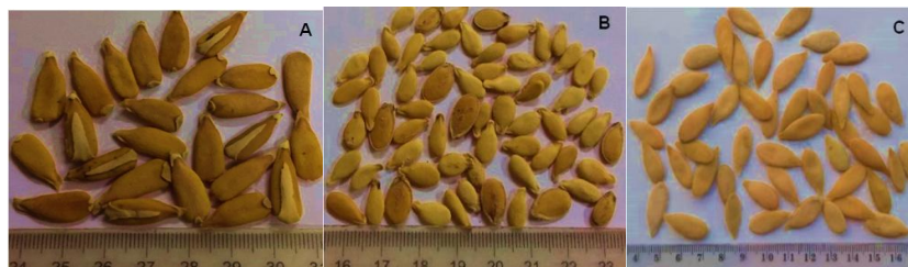
Fig. 1. Seeds of cucurbit varieties. A: Lagenaria siceraria Molina Standl (Bebou); B: Citrullus lanatus sp (Wlewie); C: Cucumeropsis mannii Naudin (Nviele)

All experiments were conducted in triplicates. Data were submitted to analysis of variance (ANOVA) using SPSS software (SPSS 22.0, USA). Means were expressed with their Standard Deviation (SD) and compared using Student-Newman-Keuls and Least Significant