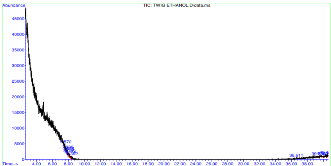
Fig. 3. Mass spectrum of ethanol extract of Morus mesozygia Linn. Stapf. twig

File :C:\msdchem\1\data\TWIG ETHANOL.D Operator : Acquired : 17 Oct 2018 13:06 using AcqMethod SCAN.M Instrument : GCMS Sample Name: TWIG ETHANOL Misc Info : Vial Number: 1