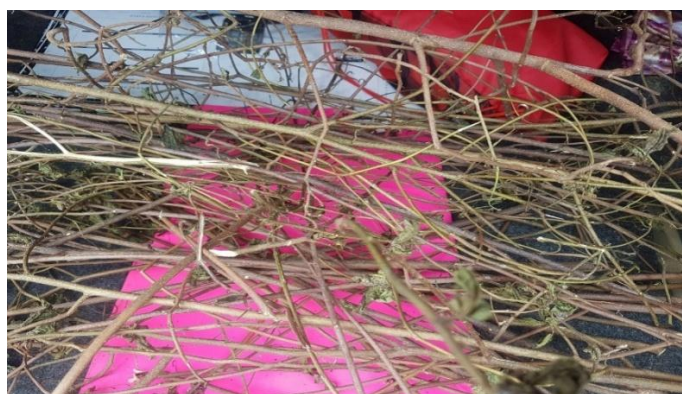
Fig. 1. Twigs of Morus Mesozygia Linn. Stapf.

The Morus mesozygia Linn. Stapf. or African mulberry tree is planted using seedlings which grows to a height with a crown of 1.5 to 1.8 meters from the ground level and its specially raised with the assistance of well cultivated saplings and a stem girth of 10-13cm. It grows richly in the loamy soil and in a rainy area to tolerate drought to a period of about 8 to 10 months. Block formulations are erected for the plantations of these trees to a spacing of about 1.8 by 1.8m. After allowing the plant to prune to a height of 1.5 to 1.8m, the shoots are allowed to sprout out with a peak of 8 to 10 shoots at the crown after which the leaves are harvested mainly by leaf-picking during rainy seasons [4].